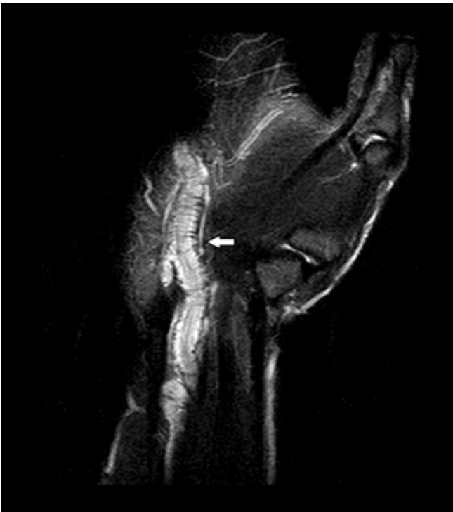
Figure 3. Coronal STIR image showing us aneurysmatic dilatation of Ulnar artery and lose of signal void (arrow).

thenar section of the hand could lead to ulnar artery damage, Conn et al. used the term “hypotenar hammer syndrome” in 1970 [1].